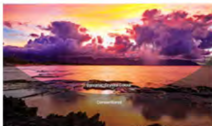
Dynamic Crystal Color