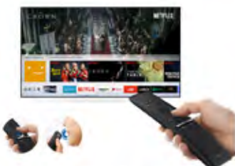
One Remote Control