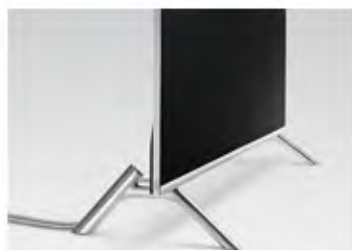
Premium UHD TV: Clean Cable