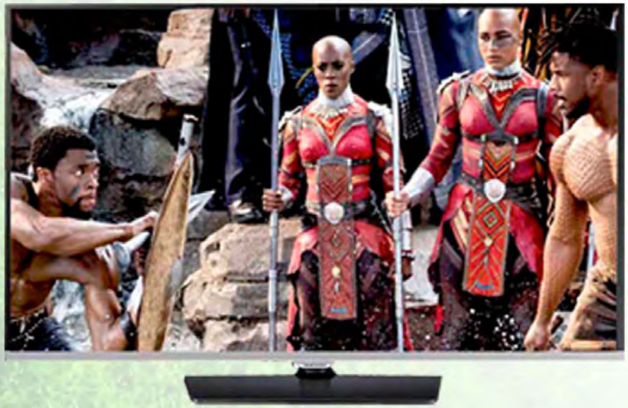
FHD LED TV Series H5200

58" B$1099 (Free Standard wall bracket & installation)