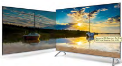
Samsung HDR Quantum Dot

To understand how it is differentiated with UHD TV, watch videos