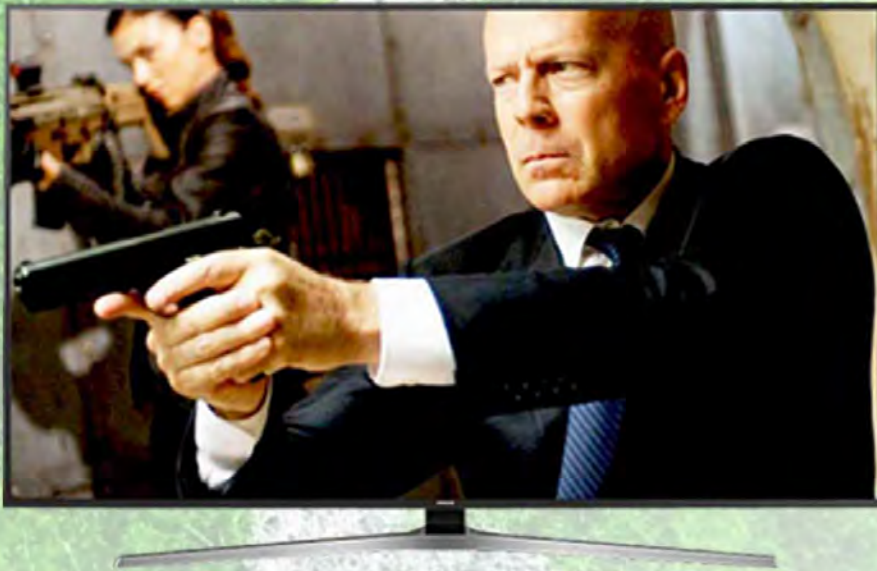
FHD LED TV Series M5100

58" B$1099 (Free Standard wall bracket & installation)